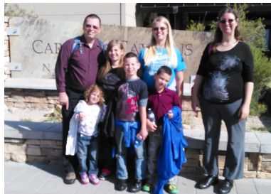
After the Faith Promise Conference we took a day to visit Carlsbad Caverns.

During the conference we purchased a much needed weight distribution hitch and anti-sway bar for our travel trailer. We really appreciated Bro. Woodside and Pastor Bailey along with several members of Northcrest who helped us install the system on our trailer. We gained so much stability and are able to pull our trailer much more smoothly now.