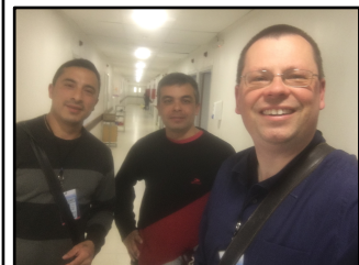
Preaching at the hospital continues!