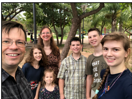
This is the picture that we took from the plaza in Malvinas Argentinas on the last Sunday of the month.