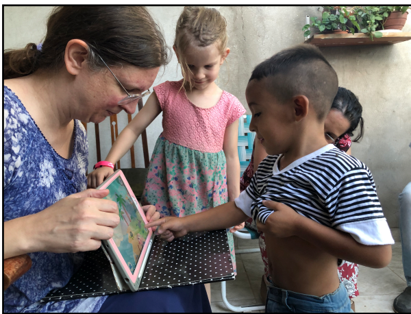
Picture from our last Wednesday to meet as a group