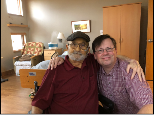
My last time to talk to and see my stepdad!