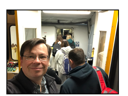
Preparing to board plane!

Church Address PO Box 1334 Mt. Pleasant, TX 75455