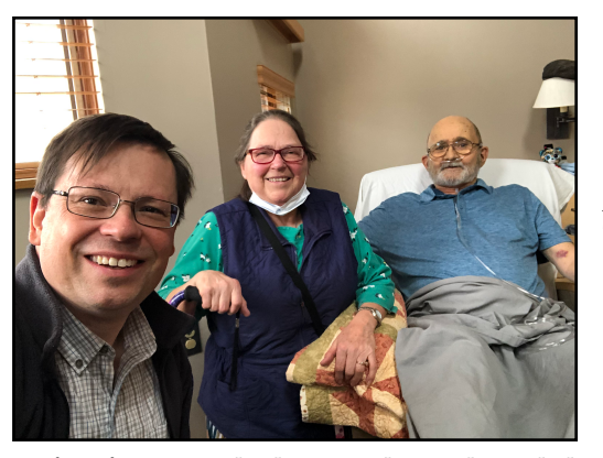
First time to see both my mother and stepdad in the same room since I was a teenager!