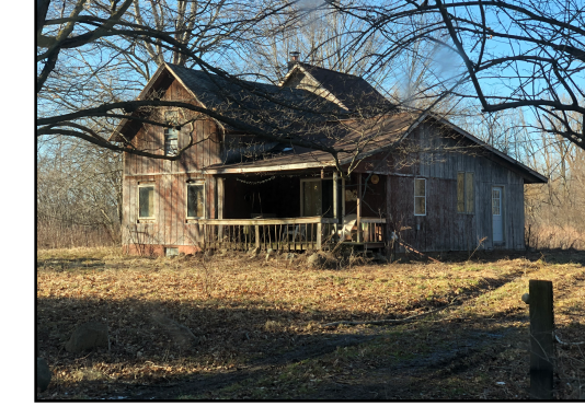
Farm house, where my mother grew up.

Thank you all so much for your continued prayer and support!