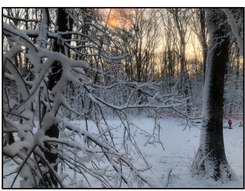
View from the back yard at my mother's house.