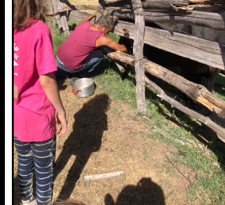
The kids, learning how to milk a cow!