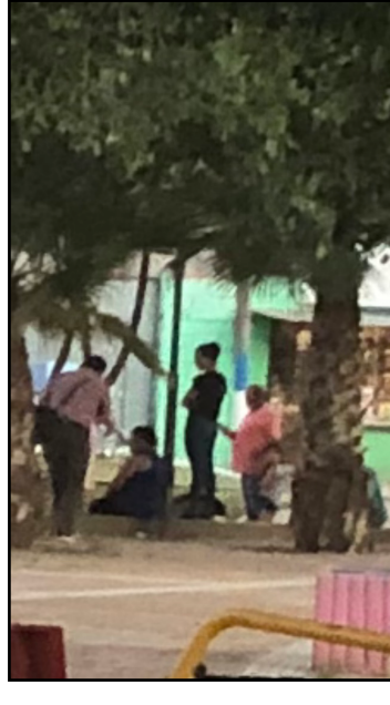
My wife had snapped a picture of me from the other side of the plaza passing out booklets and talking to people.