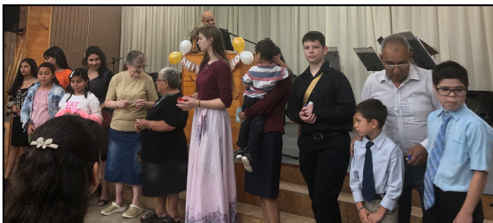
Recognition of March Birthdays at Templo Bautista