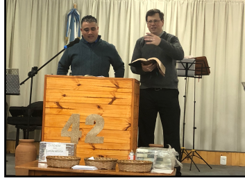
Translating the message and Sunday School for our guests from the US

First time to find a jalapeño in Argentina!