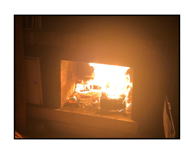
First fire of the year in the fireplace. The weather has begun to drop as we move closer to winter!

Church Address PO Box 1334 Mt. Pleasant, TX 75455