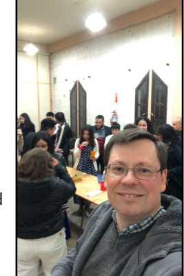
With the kids at a vouth conference