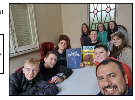
The kids finished another semester of classes at our Homeschool Coop