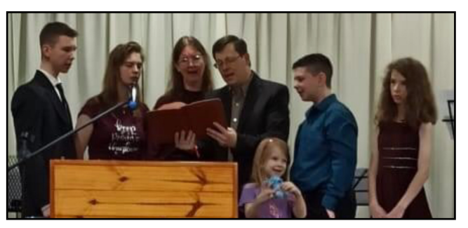
Thankful to be asked to sing a special as a family!