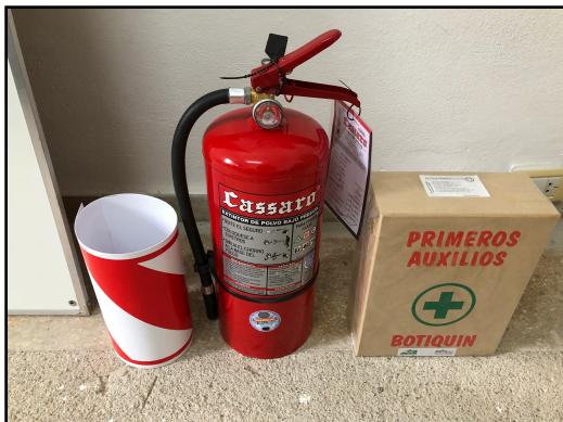
Fire extinguisher and First aid kit for the building!