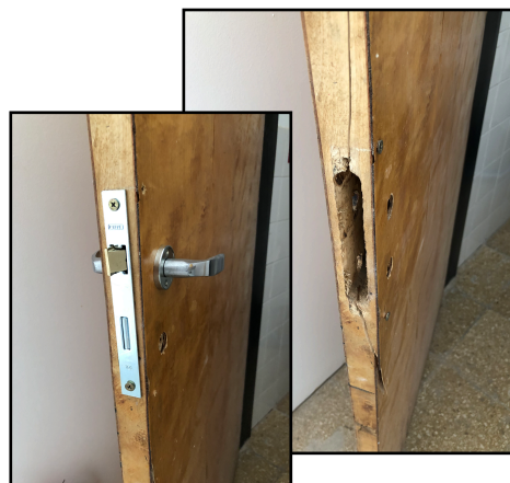
Getting little details fixed!