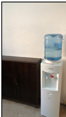
Water cooler and pantry for the meeting place!