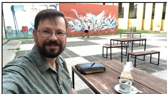
The courtyard of the University cafeteria, a great place to either read or interact with students!